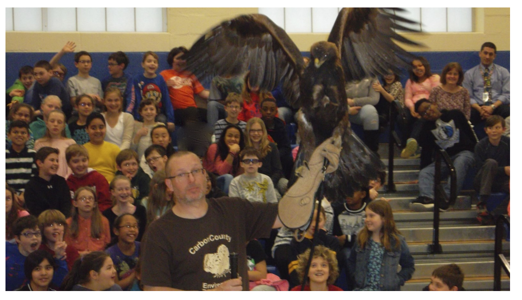
A CCEEC employee shows students the wing span of an eagle.

mals were rescued and are cared for by the CCEEC. It was awesome to see the strong and powerful birds. The eagle's wing span was impressive! Finally, WREC students and teachers are anxiously awaiting the birth of two eaglets in Hanover, PA. The estimated due dates are March 24 and March 27. Check out the Eagle Cam! http://www.portal.state.pa.us/ portal/server.pt?open=514&objID =1592549&mode=2 and click on Game Commission.